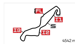
TT Circuit Assen